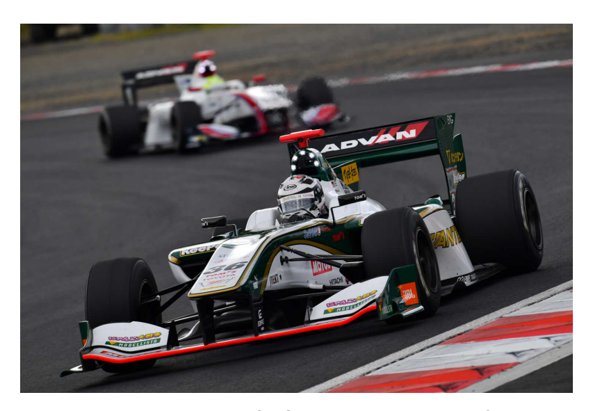
No. 36 Andre Lotterer (VANTELIN TEAM TOM'S) currently sits at the top of the driver standings

Can the leading group keep up their momentum and will the rookie drivers move up the standings? These are just some of the questions for Round 3 as we approach the midpoint of the competition.